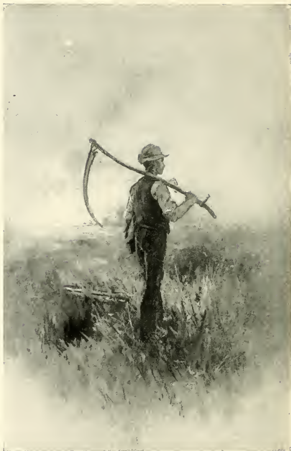
Brushing with hasty steps the dews away